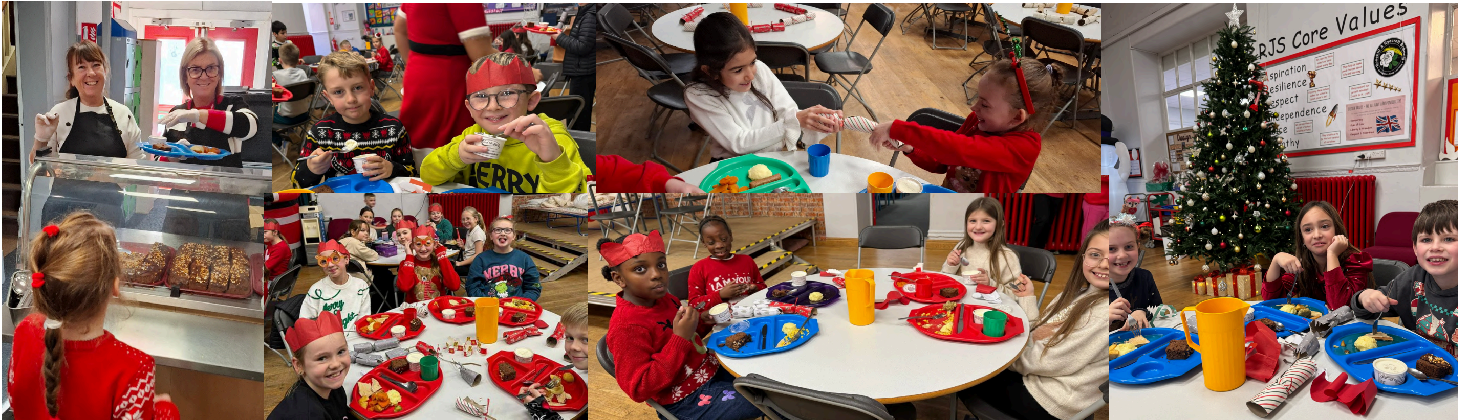
What a cracking Christmas Dinner!