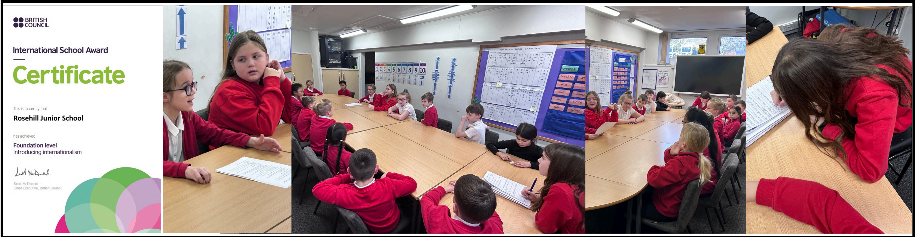
Our Student Council mid discussion about behaviour in school.