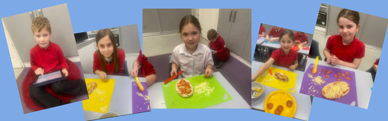
Pizza, & Games for our 'Always' Children 🍕

Our Lower Phase "Always Children" enjoyed a fantastic reward session this week, filled with DIY pizza making and a variety of high-energy games. The room was buzzing with excitement—and perhaps a little too much cheese! It was a joy to see so many smiles and celebrate the hard work of our wonderful students.