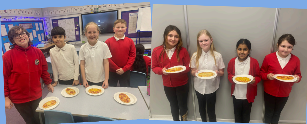
Pizza, & Games for our 'Always' Children 🍕

Our Upper Phase "Always Children" enjoyed a fantastic reward session this week, filled with DIY pizza making playing games. together and listening to music. The atmosphere was electric—and perhaps a little bit "cheesy"—as we gathered to celebrate our incredible students! It was wonderful to see the room buzzing with excitement as we recognized the hard work and dedication shown across the school.