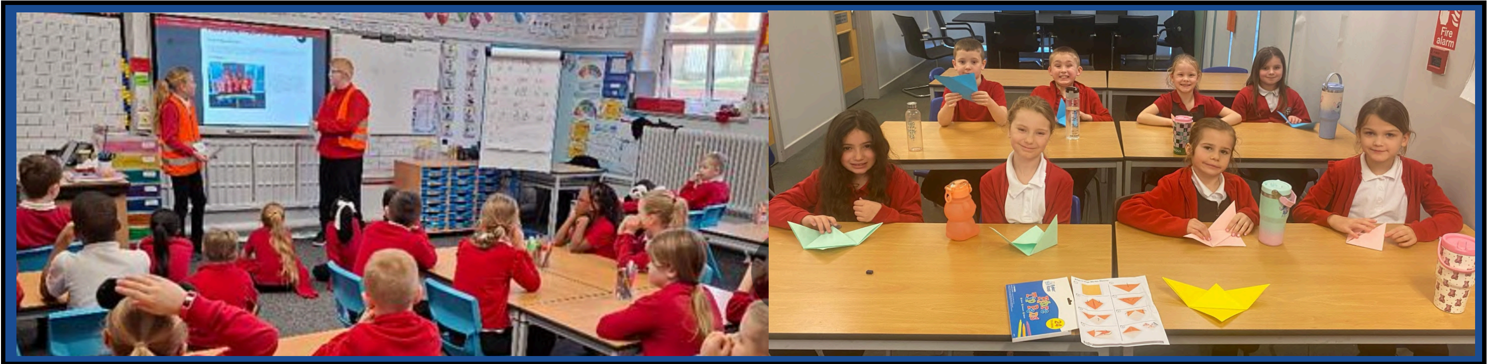
Our playground leaders class assemblies were great! Origami fun for our 'Always Club' children this week..