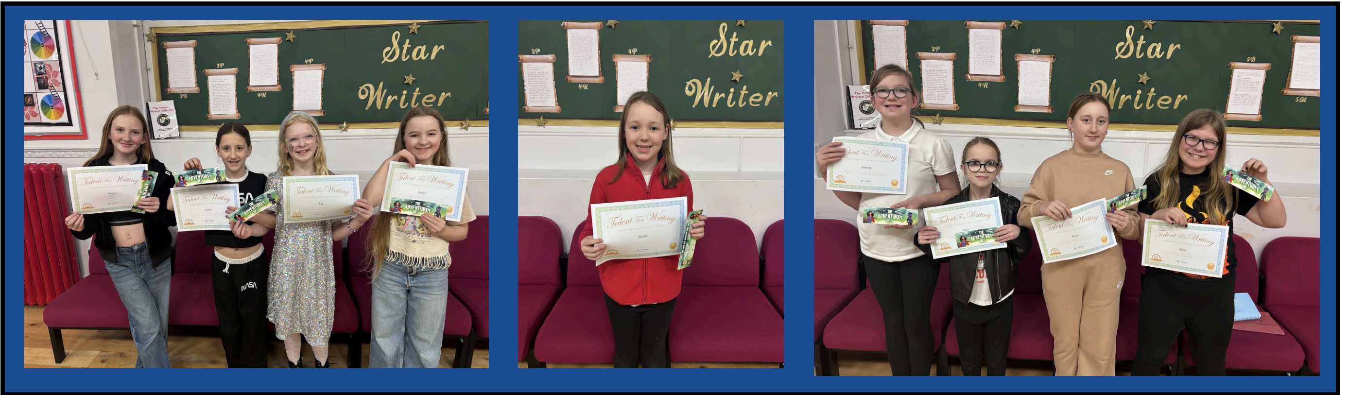
So Proud of our Published Authors!