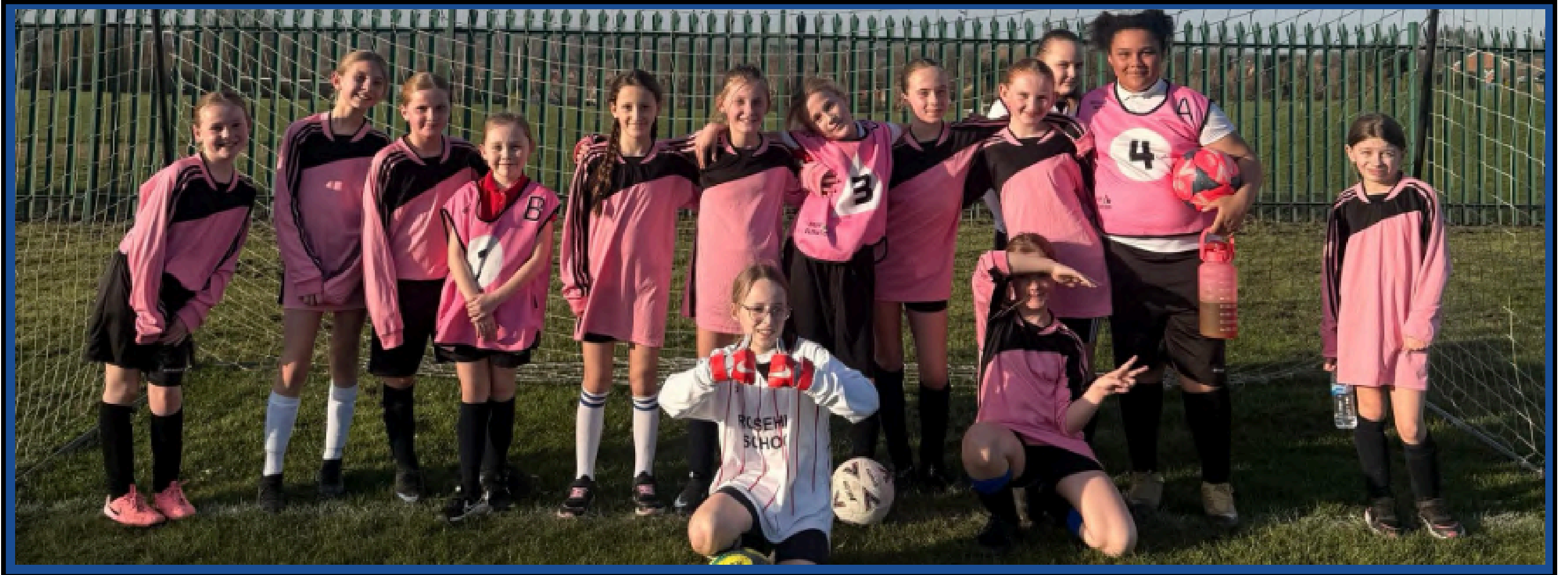
Rosehill's Girls' Football Fixture vs Wath Central!