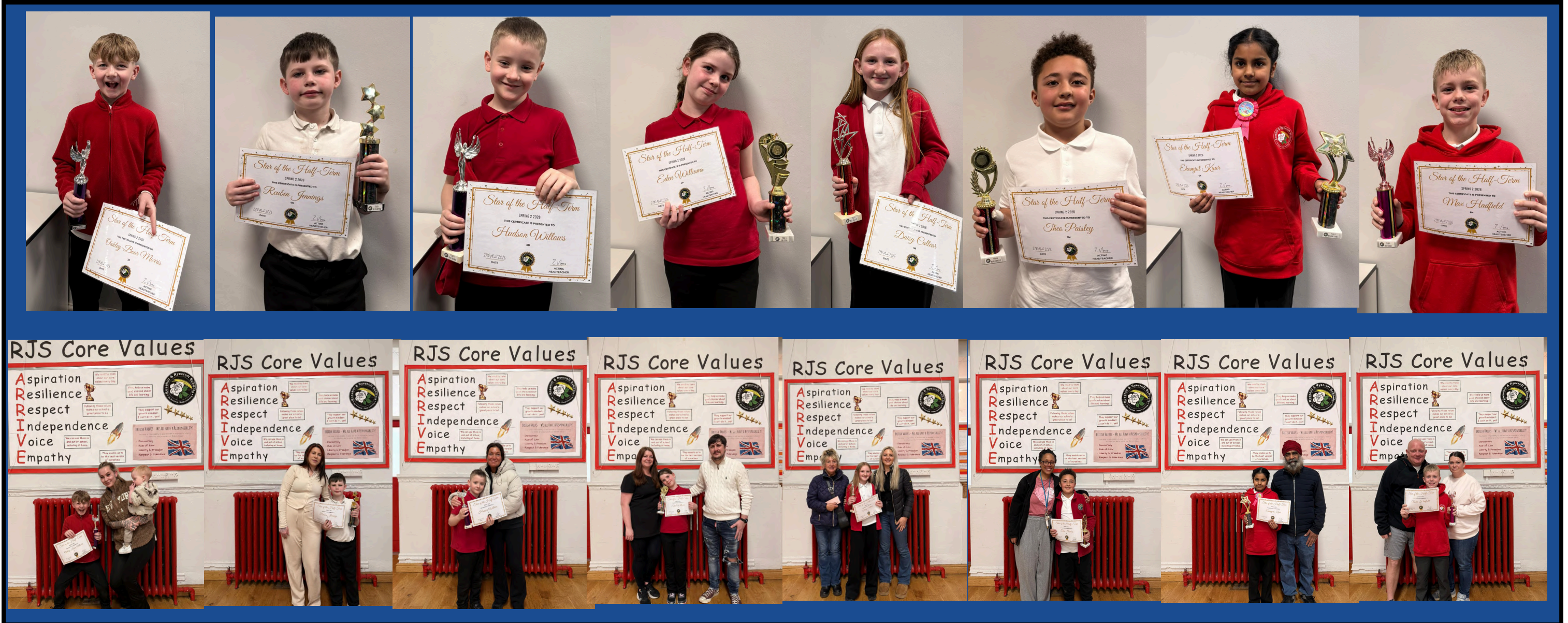
Congratulations to all who received our 'End of Half term Awards'