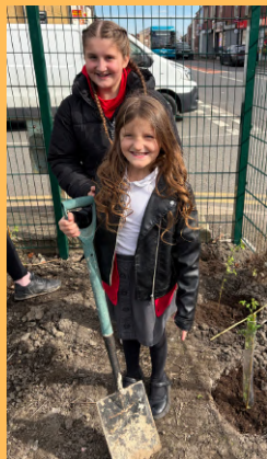
A real 'Tree ..t!

Our Ground Force Team returned this week