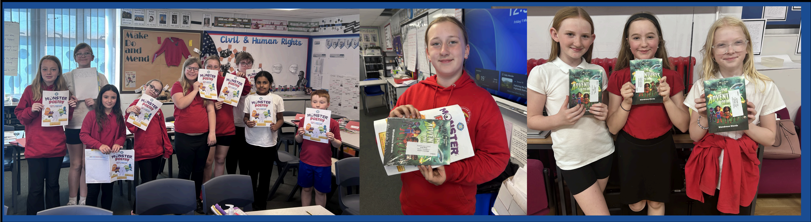
A new project for Poetry Club & Copies of books proudly received by our published writers