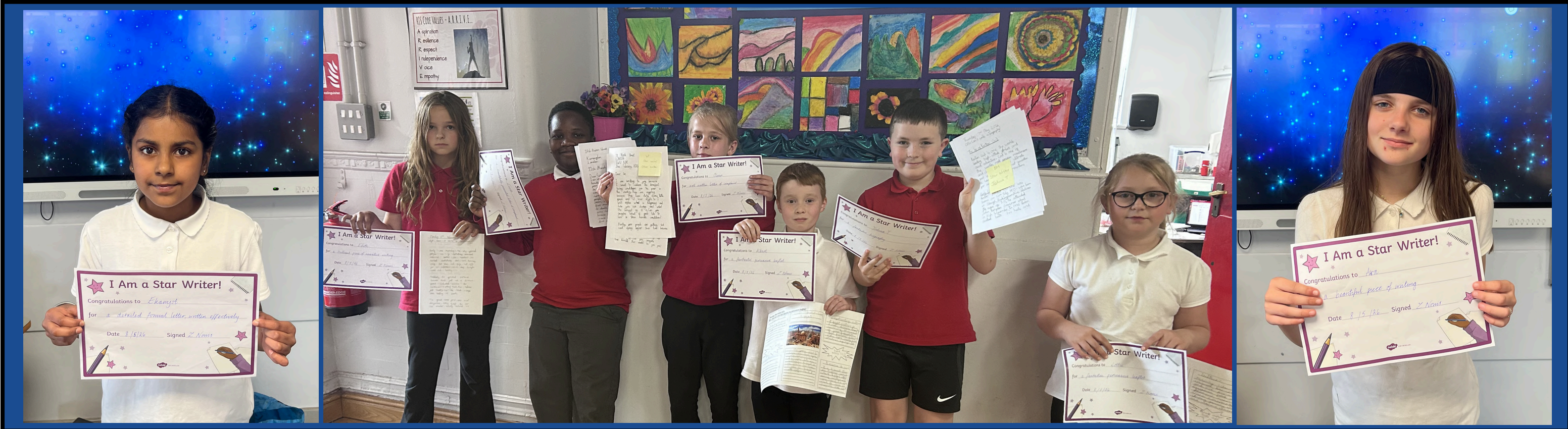
Congratulations to our new Star Writers