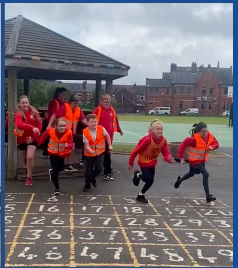
Our Playground leaders (a.k.a movie stars) made a fabulous video this week.