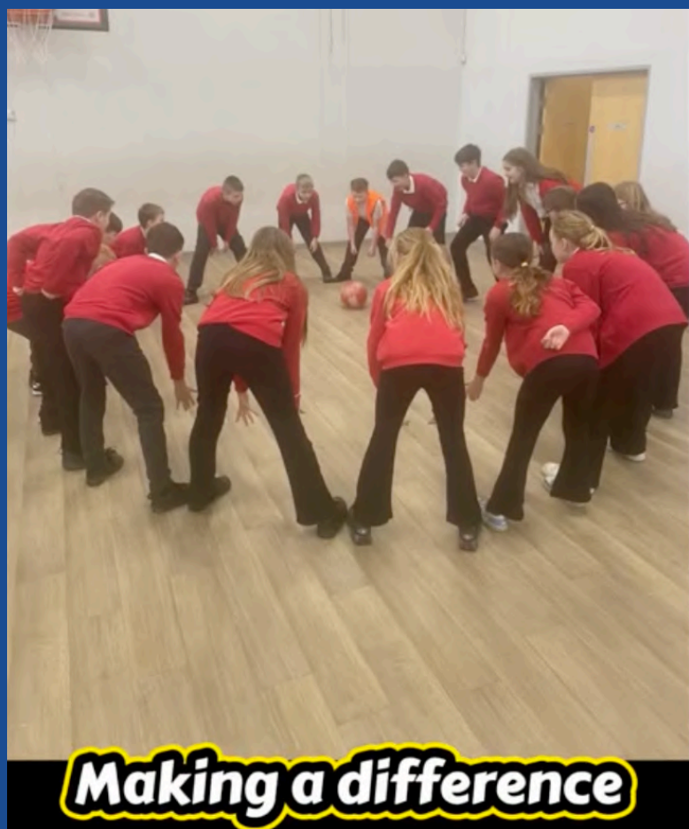
Making a difference