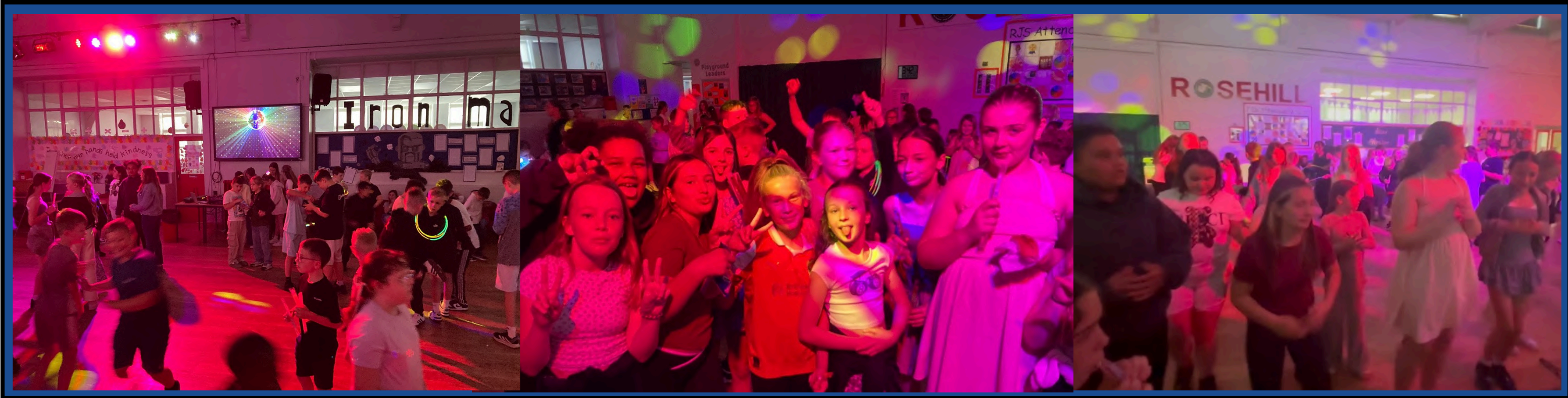
Lot's of fun at our Summer Disco